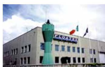
FLOATEX ITALY www.floatex.com

Email: richard@floatex.nl - Website: www.floatex.nl