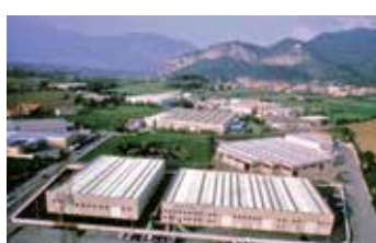
FLOATEX ITALY www.floatex.com