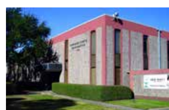
TIDELAND SIGNAL CORP. USA www.tidelandsignal.com