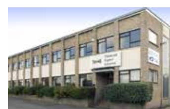
TIDELAND SIGNAL LTD U.K. www.tidelandsignal.com