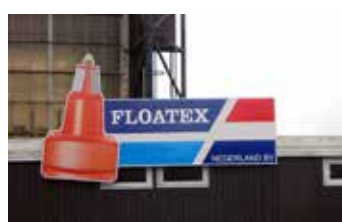
FLOATEX NEDERLAND www.floatex.nl